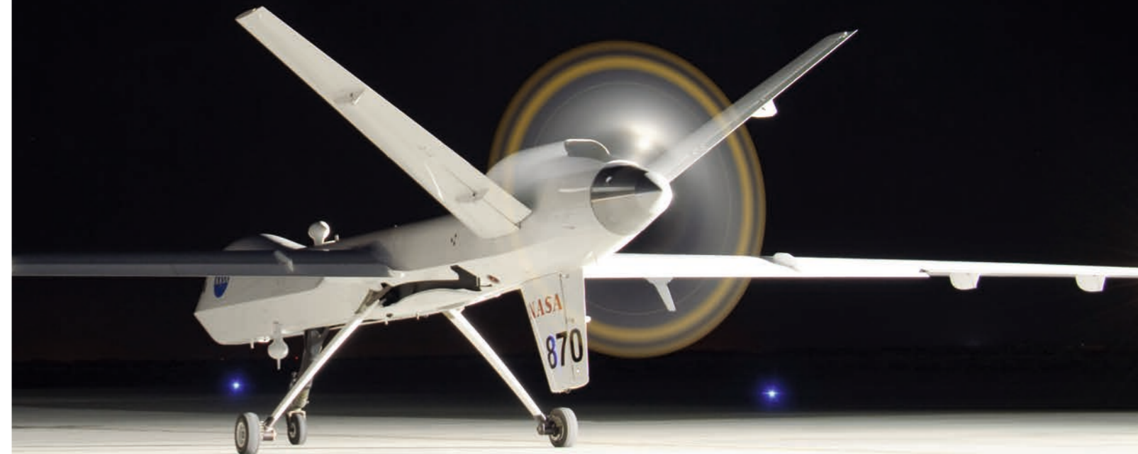
Photo: TE12 test wrap UAV, June 27, 2012 by NASA. Licensed under Creative Commons.

“The drone market has been estimated at many tens of billions of dollars and is forecast to continue to grow significantly over the next decade. It is important that standards are developed to protect and support this potential.”