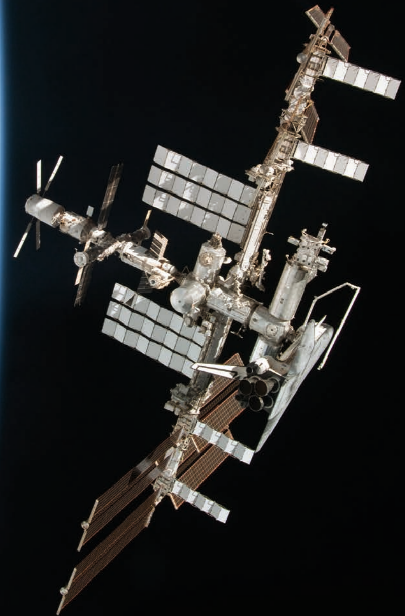
Photo: The international Space Station with crew 27 by NASA. Licensed under Creative Commons.

“Customers who understand TES will find real value for money from the in-service support of their assets.”